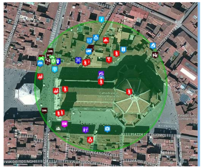
Figure 2: ServiceMap results performing the visual query on Km4City knowledge base.

Figure 2). In Sii-Mobility, the developers may use the ServiceMap tool to compose visually some geographical and textual queries, and from them to request the sending of an email containing the calls that can be performed for obtaining the same resulting data in JSON and/or web page in HTML. In Figure 2, the ServiceMap at work is presented.